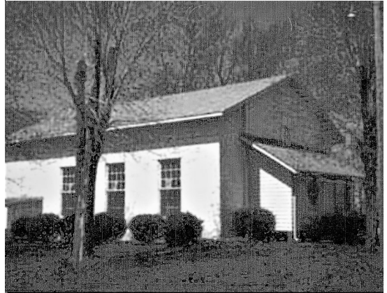
Coldwater Church, 15245 New Halls Ferry Rd. at Greenway Chase, Florissant, 1851

Wehmer. The new church was dedicated May 24, 1959. On April 26, 1970, ground was broken for the new three story educational building. In 1985, Salem completely remodeled and enlarged the auditorium and added office space.