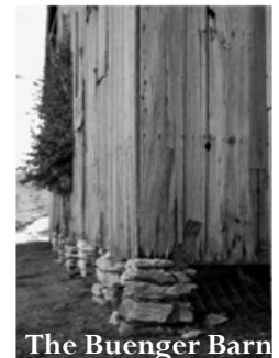
The Buenger Barn

and households. The profile of Old Jamestown, with regard to all the data compiled, will be available as a handout at the May 3rd Spring Meeting. As more data becomes available, it will be posted on the Association's web site, www.oldjamestownassn.org