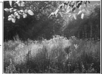
Prairie grass in the OJ area