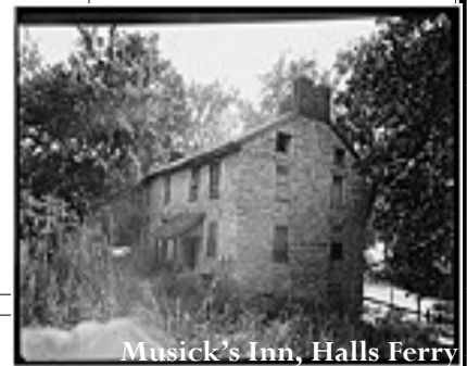
Musick's Inn, Halls Ferry